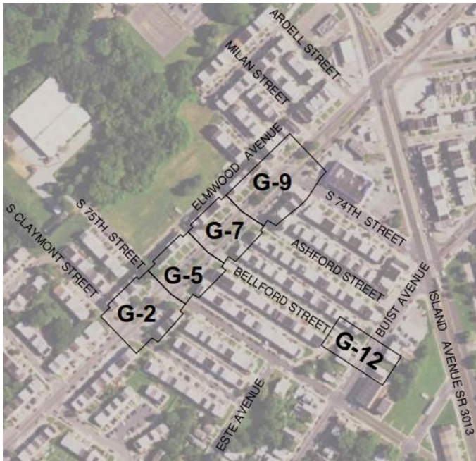
FIGURE 1. Project location (aerial view)