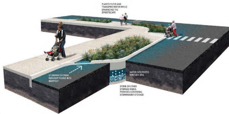
At Right: Graphic rendering of completed work at Bingham Street near E. Godfrey Avenue.