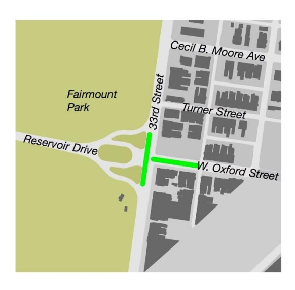
Areas impacted by construction