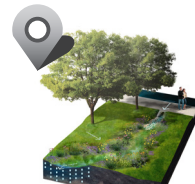
Median or Swale