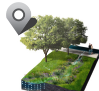
Median or Swale