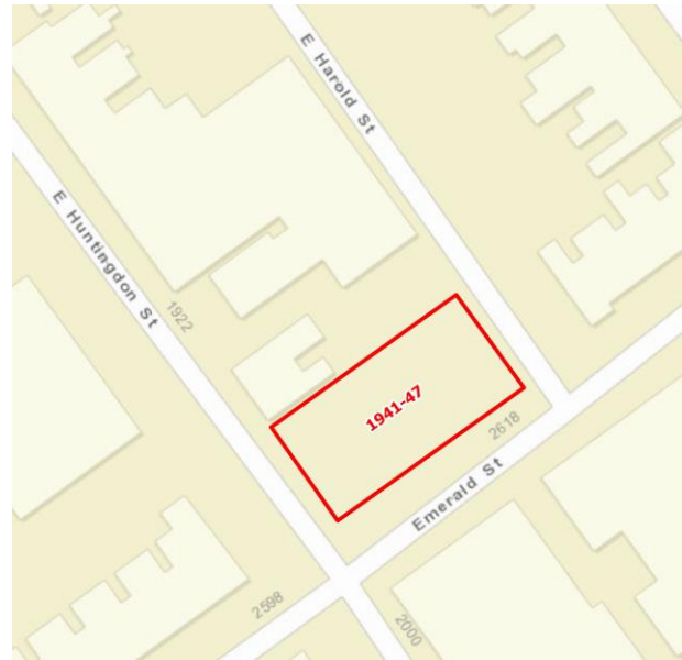
FIGURE 3. Project location (street view)