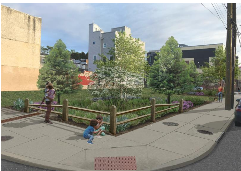
FIGURE 1. Graphic rendering of completed PWD facilities at the Huntingdon Emerald Vacant Lot

Coordination with Arcadia Commons and existing utilities (PECO, PGW, and Verizon) will be on-going during the construction. This cooperative approach minimizes inconvenience and potential future service disruptions.