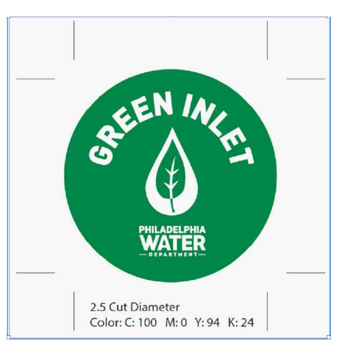
GREEN INLET CURB MARKER DETAIL