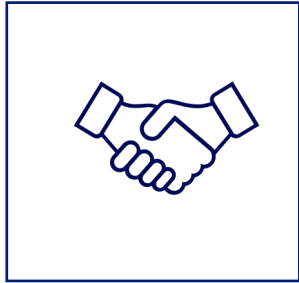
Welcome & Icebreaker