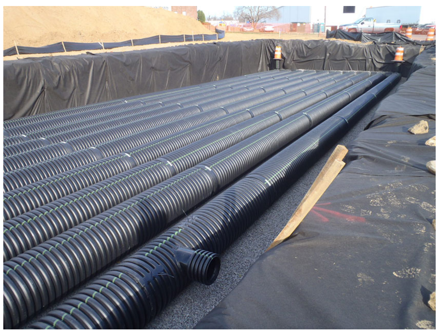
An example of a subsurface infiltration basin in Philadelphia