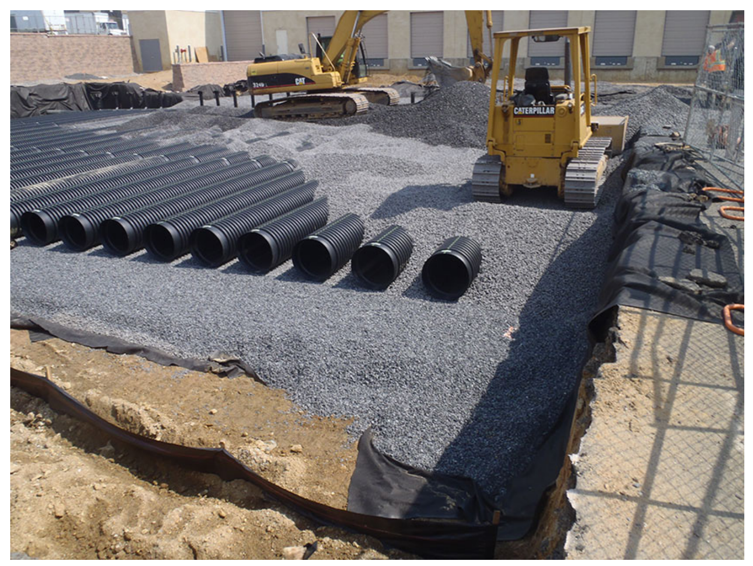
An example of a subsurface infiltration basin installation in Philadelphia

Proper construction and careful consideration of soil compaction, infiltration performance, and sedimentation control of subsurface infiltration SMPs are essential to ensure long-term functionality and reduce long-term maintenance needs and costs. Since subsurface infiltration SMPs are, by definition, buried, construction oversight is critical. At a minimum, verification of volumes, grades, and elevations must be performed prior to backfill.