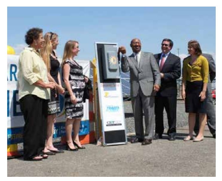
The ribbon cutting ceremony celebrating the solar panel installation.

In August of 2010, PWD commenced with the installation of its first solar panel array. This photovoltaic system consists of 1,014 solar panels and is located at the Southeast Water Pollution Control Plant. The renewable energy generated by the system substitutes a fraction of the electricity that would otherwise have to be purchased by the Department to power plant operations. On August 25, 2011, Mayor Michael A. Nutter appeared at the ribboncutting ceremony for the installation to acknowledge PWD's accomplishment and how it contributes to helping the City meet its energy goals.