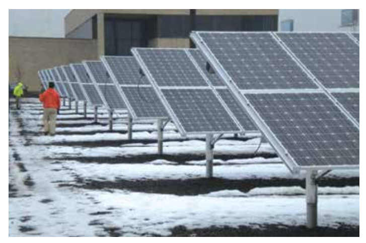
Operators working at the Southeast solar panel array.