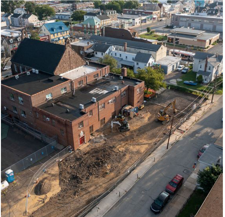
In mid-2021, crews work on repaving the rear parking area after installing a subsurface basin.