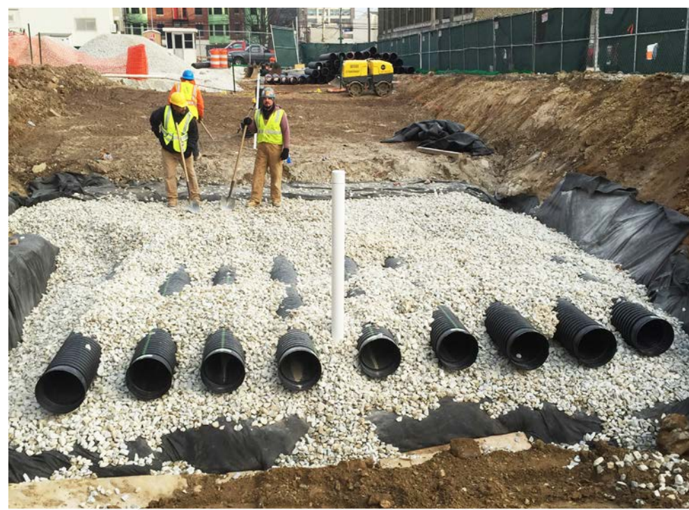
During construction, construction crews install layers of soil, rock, and drains that exist beneath the parking lot to divert sewer overflows away from waterways.

Learn more about PWD's Stormwater Programs: water.phila.gov/stormwater