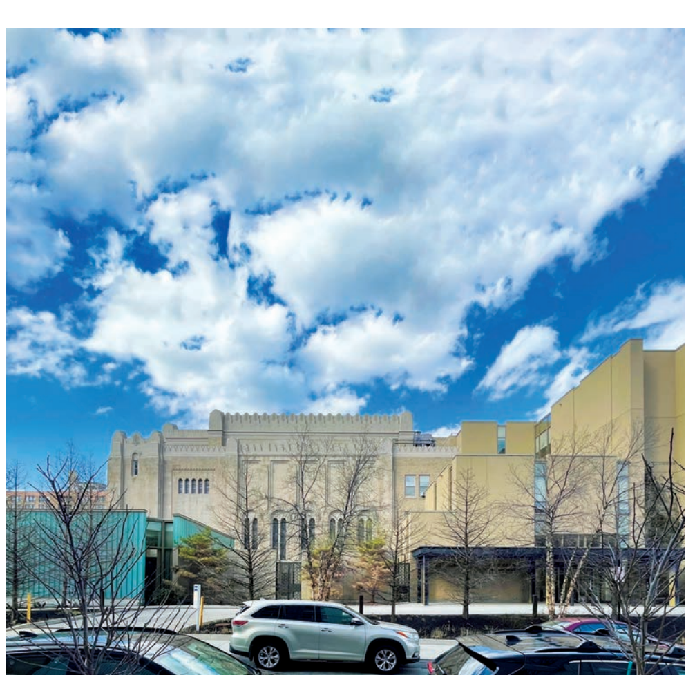
At Congregation Rodeph Shalom, located on North Broad Street between Green and Mt. Vernon Streets, new landscaping and repaved surfaces cover a large subsurface basin managing stormwater.

Several congregations prioritize the responsible stewardship of natural resources. Installing stormwater systems on their sites positively impacts our region's environment by reducing combined sewer overflows entering our creeks and rivers.