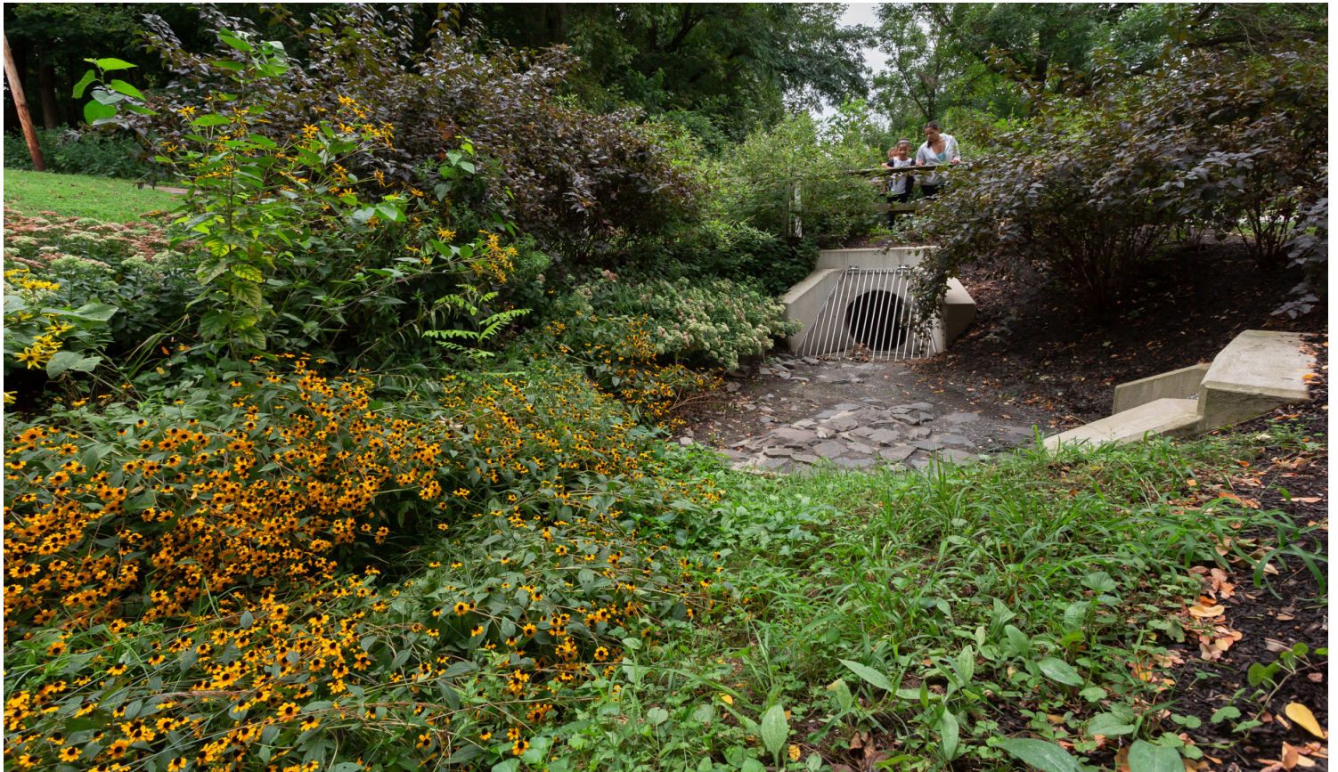
Example of rain garden in Philadelphia

Join the Philadelphia Water Department to learn about upcoming projects in Germantown and the rain gardens coming to the 229 E. Logan St. vacant lot