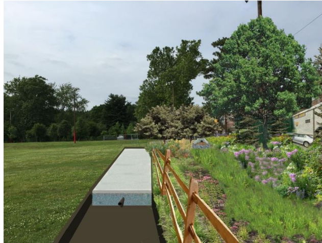
At Right: Graphic rendering of completed work in Morris Park adjacent to 68 th Street.