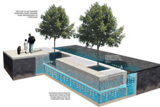
At Right: Graphic rendering of completed work along N. 9th Street near W. Oxford Street.