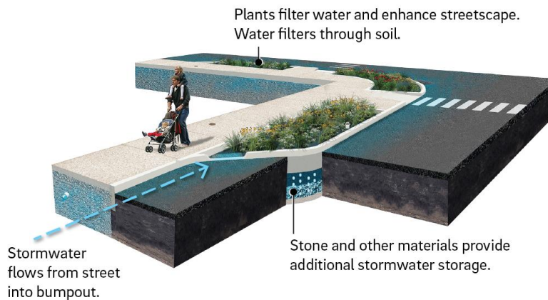
At Right: Graphic rendering of a completed bumpout similar to the one to be constructed Wolf Street near S. 20th Street.