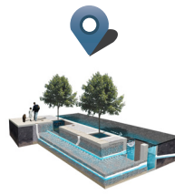
Stormwater Tree Trench