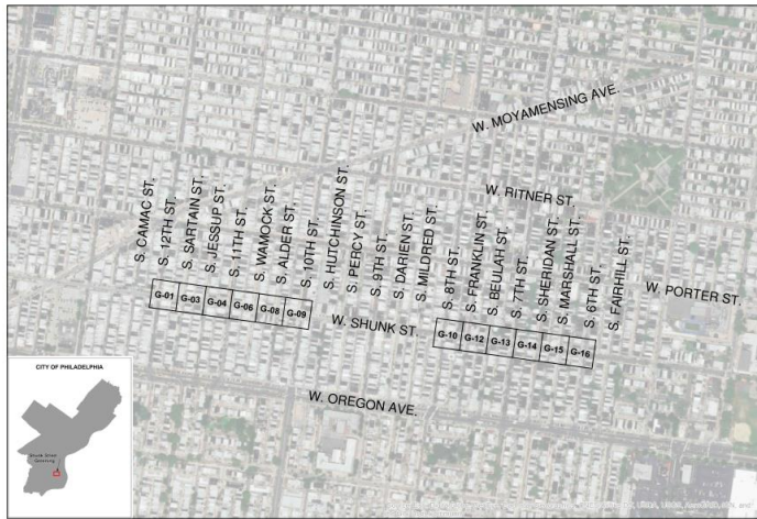
FIGURE 1. Project location (aerial view)