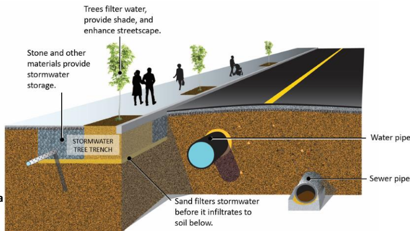
At Right: Graphic rendering of a stormwater tree trench.