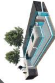
Stormwater Tree Trench