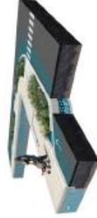
Stormwater Bumpout (Corner and Mid-block)

These tools capture rainwater to protect our rivers. For more information on green tools, visit: www.phillyh2o.info/gccw