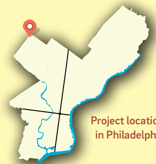
Project location in Philadelphia