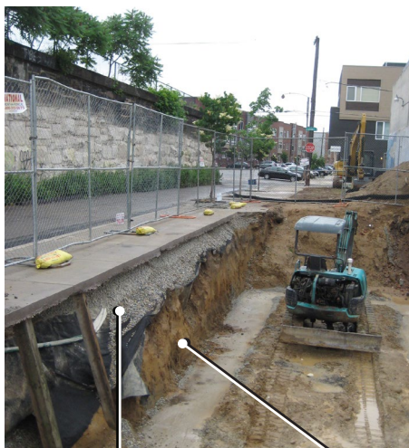
Subsurface Stone Adjacent Excavation

State and federal regulations require our city to reduce the pollution discharged into our rivers when it rains. GSI helps meet these regulations. Our combined sewer overflow prevention program, Green City, Clean Waters, reduces pollution and provides secondary benefits to communities around Philadelphia.