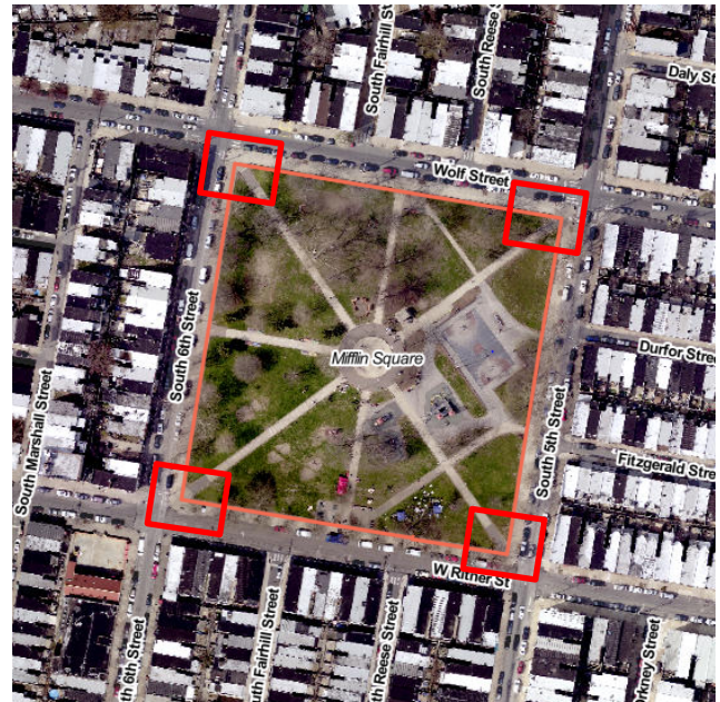
FIGURE 3. Project location (Aerial view)