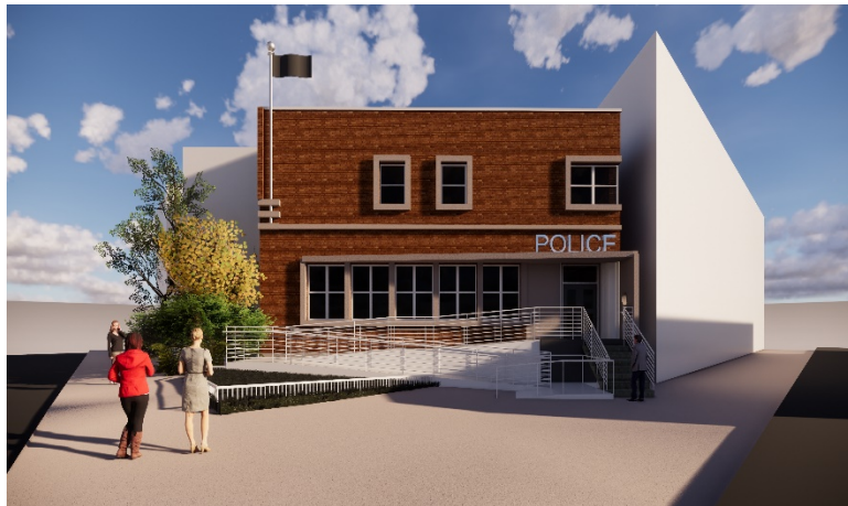
At Right: Graphic rendering of completed work at 16th Police District Headquarters (3900 Lancaster Ave)- rendering by Stantec Consulting Services Inc.