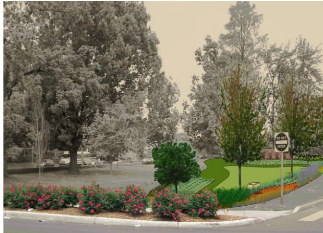
At Right: Graphic rendering of completed work at Hunting Park Avenue near Cayuga Street.