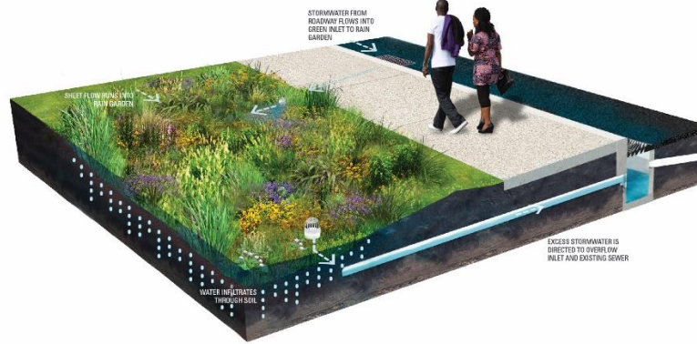
At Right: Graphic rendering of completed work at Queens Place near W. Oxford Street.