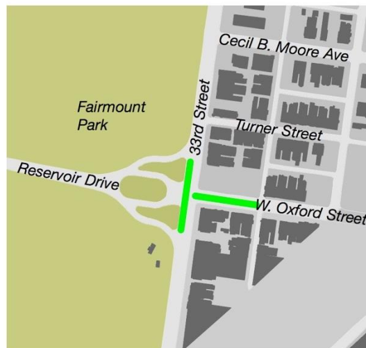
Areas impacted by construction