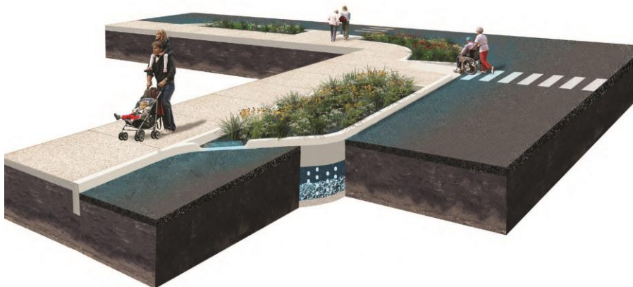
FIGURE 1. Graphic rendering of typical completed PWD facility.

Coordination with PECO, PGW, and SEPTA is on-going during the construction. This cooperative approach minimizes inconvenience and potential future service disruptions.